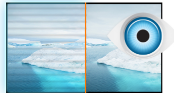
Flicker-free + Blue light

VA panel technology offers higher contrast, darker blacks and much better viewing angles than standard TN technology. The screen will look good no matter what angle you look at it.