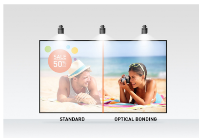
Optical bonded PCAP

The flexible stand can be positioned at several angles creating a comfortable and ergonomic user experience and the integrated cable management system hides all the cables and electrical wires giving a neat and cable-free workspace. The ProLite T2438MSC-B1 can be used in landscape, portrait and face-up orientation. A perfect solution for interactive signage, instore retail, POS and interactive presentations.