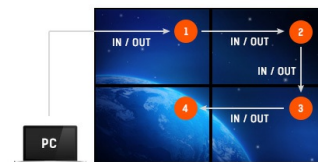
Daisy Chain Support

AMVA3 technology offers higher contrast, darker blacks and much better viewing angles than standard TN technology. The screen will look good no matter what angle you look at it.