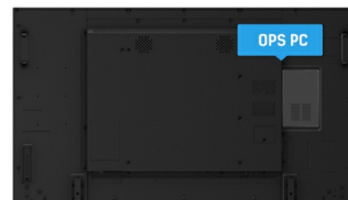
OPS PC SLOT

IPS displays are best known for wide viewing angles and natural, highly accurate colours. They are especially suited for colour-critical applications.