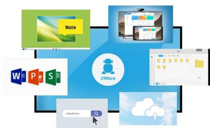
iiWare 8.0 (Android OS)

Share, stream and edit content from any device directly on screen and transform your team meetings or lessons into an easy, fast and seamless interactive session with the included WiFi module ( OWM001 ) and the ScreenSharePro app.