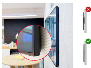
Zero-Gap Wall Mount

Designed to perform in continual, around the clock environments, the LH5570UHB can be installed and utilised in landscape and portrait orientation. The jaw dropping and best-in-class 35mm total depth (when used with the included proprietary brackets) will mean this display can be installed discretely and elegantly in all areas.